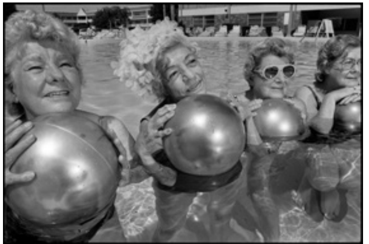
Aquagym, Saint Petersburg, Florida, USA, 1986