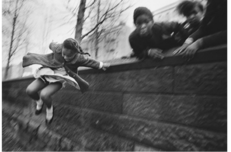
Central Park, Manhattan, New York, USA, 1967